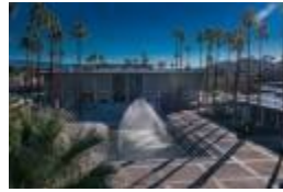
Palm Desert Campus 43500 Monterey Avenue, Palm Desert