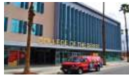
East Valley Indio Campus 45524 Oasis Street, Indio