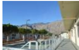
West Valley Palm Springs Campus 1300 Barista Road, Palm Springs