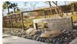
Mecca Thermal Campus 81-120 Buchanan Street, Thermal