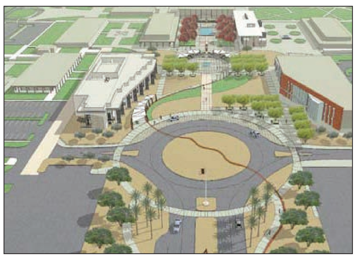
College of the Desert 2022/SUMMER Schedule of Classes