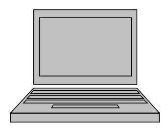
Interested in a Distance Education class?

Go to the Student Services/Online Classes page at: collegeofthedesert.edu