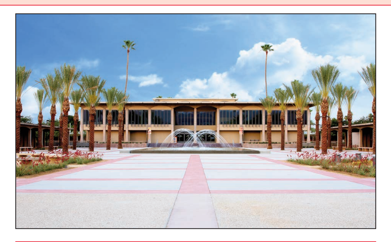
Check out our in person classes, library services, student services, and Bookstore.