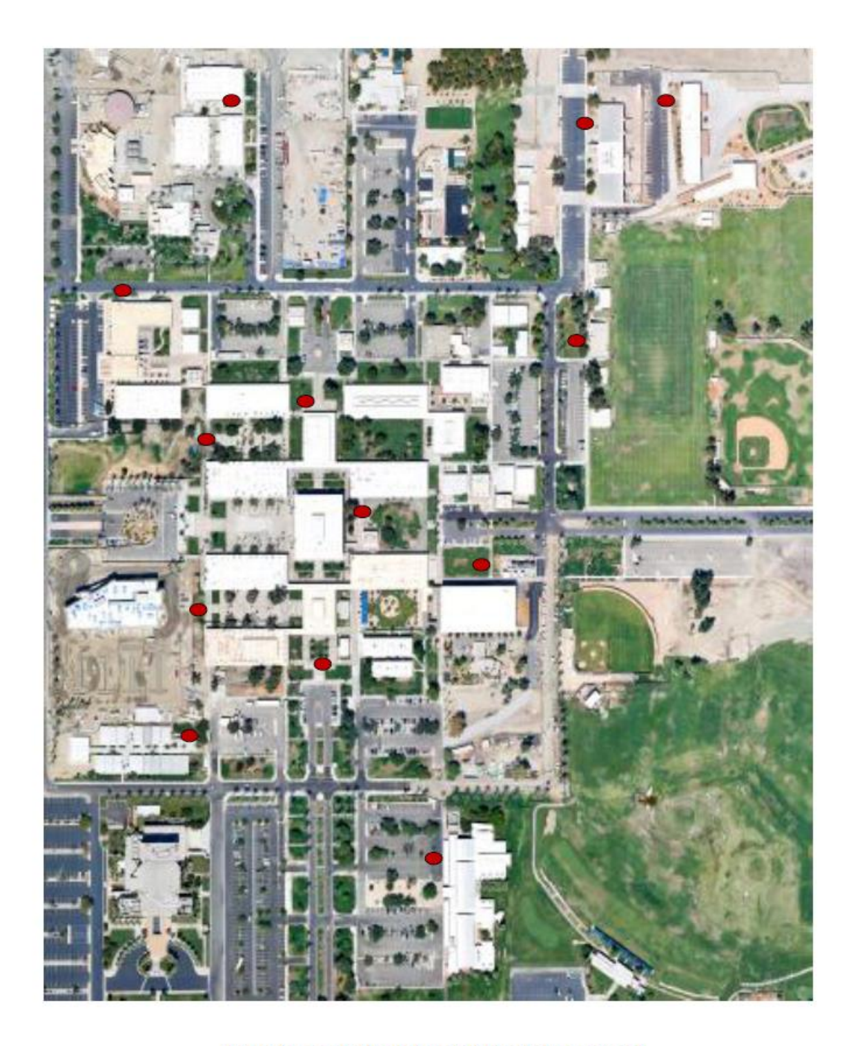
Bicycle and Skateboard Rack Locations