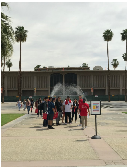
High School students receiving a tour of College of the Desert.