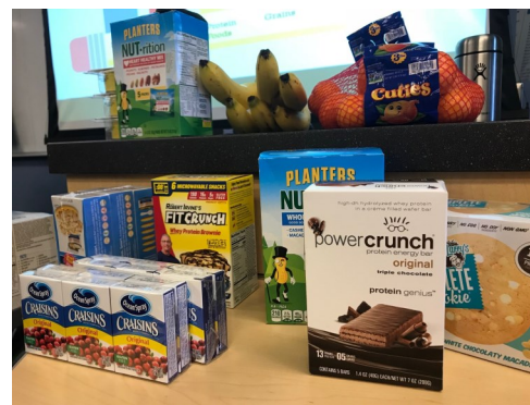
A variety of snacks were made available to students after the event.