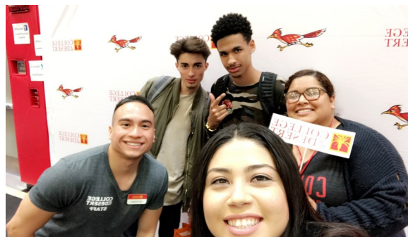
The EDGE Staff had a great time meeting high school students during the events!

A Big Thank You to all of our EDGE & pLEDGE Student Volunteers!