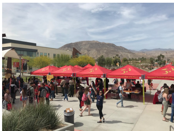
A view of the event's Resource Fair, held at the College of the Desert Amphitheater