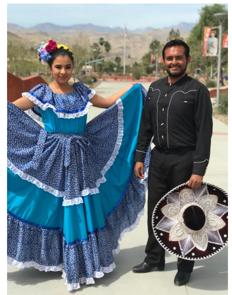
Folklorico dancers brought festive cheer to the Resource Fair